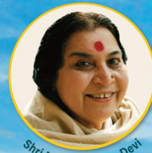
Shri Mataji Nirmala Devi