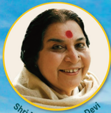
Shri Mataji Nirmala Devi