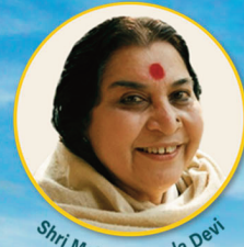
Shri Mataji Nirmala Devi