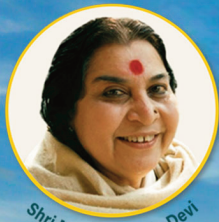
Shri Mataji Nirmala Devi