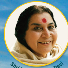
Shri Mataji Nirmala Devi